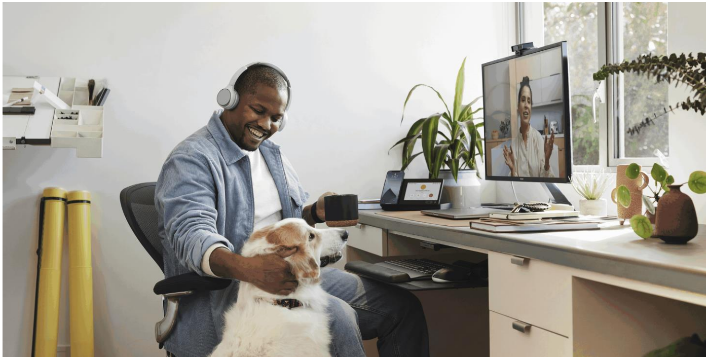
Above: Employee working from home using a Cisco Headset 730 and Webex Desk Camera

The Cisco® Headset 730 is a premium Bluetooth® headset built for business, personal, and the journey between.